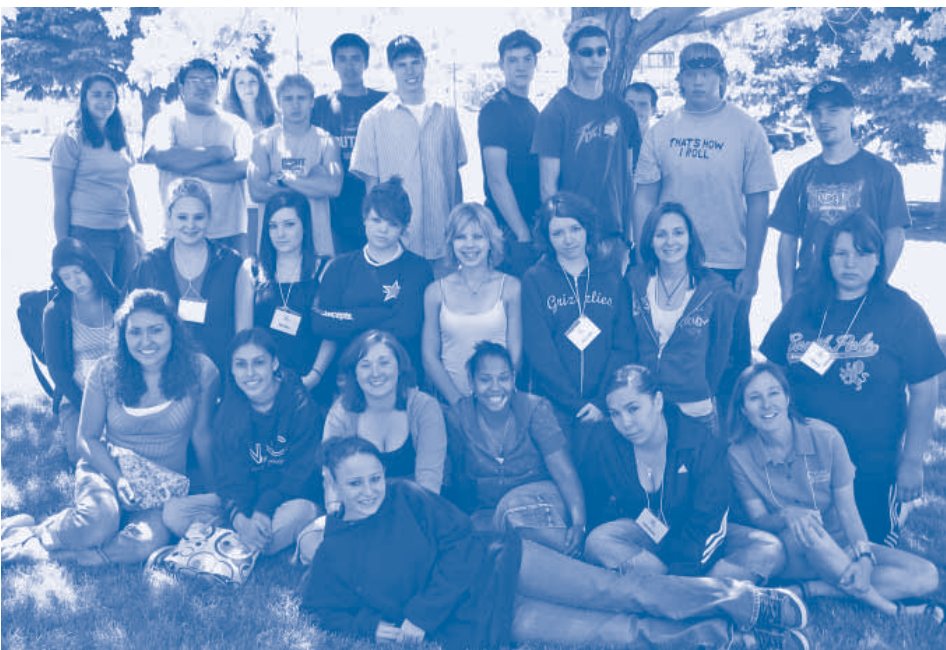
Twenty-three foster care youth attended this year's "A Step Ahead" college preparatory camp at Carroll College in Helena.