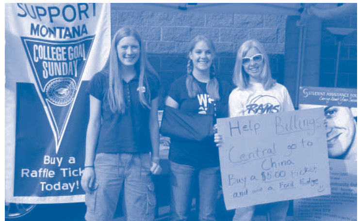
Billings Central High School band kicked off the car raffle at the Montana Fair. The group is raising money to attend pre-Olympic events in China.

Tickets will be on sale from Aug. 1, 2007 through Feb. 10, 2008. The winner will be drawn on Feb. 15, following Montana College Goal Sunday.